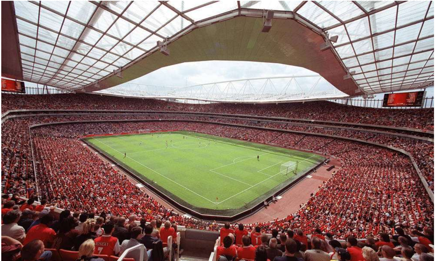
Stadiums & venues